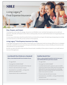
Living Legacy® Consumer Brochure