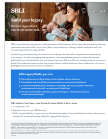
LegacyShield® Consumer Brochure