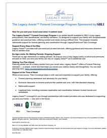
Funeral Concierge Brochure